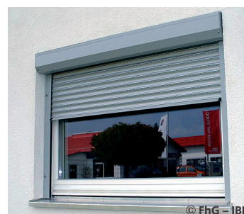
Fig. 2: External view of a window with half-closed shutters

To investigate the influence of IR reflecting surface coatings, aluminium foil is glued to the internal shutter blinds