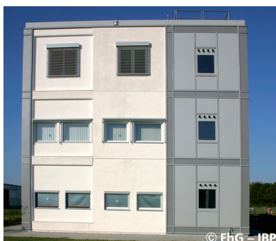
Fig. 1: Façade on the eastern side of the test facility VERU

On the eastern façade of the building – see Fig. 1 – the effect on heat transmission of closed shutters with IR re-